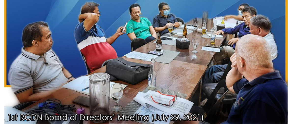
1st RCDN Board of Directors' Meeting (July 29, 2021)